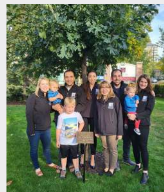
The Pompeian Family