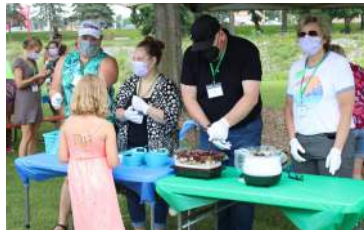
SERVING ICE CREAM AT THE TRANSPLANT PICNIC