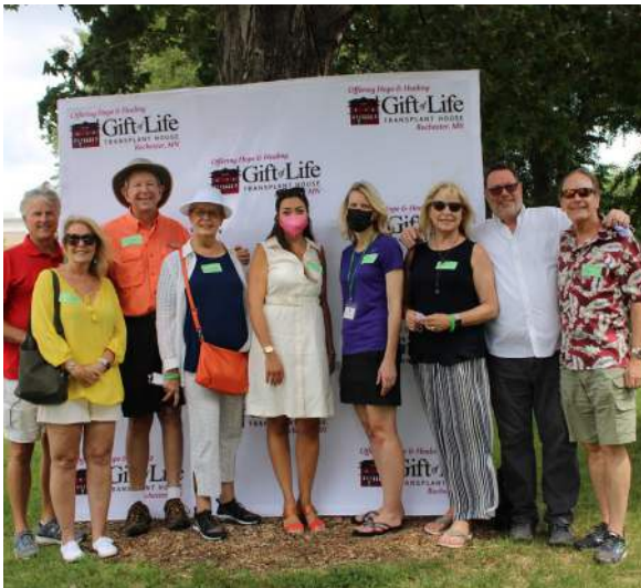
GIFT OF LIFE TRANSPLANT PICNIC