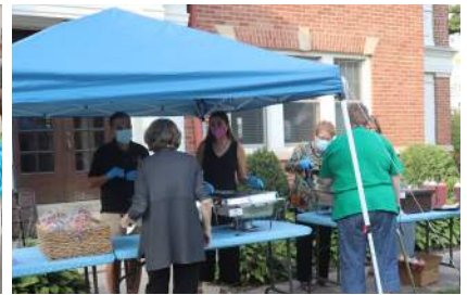
ANNUAL BBQ CATERED BY JOHN HARDYS' BAR-B-Q