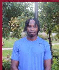
Wayman Docks Custodian